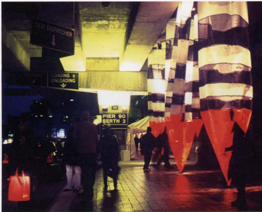
Left: Road Side Shrine II , 2002. Vinyl-coated polyethylene mesh, dimensions variable. View of work as installed at Piers 88 and 90 of the West Side Highway, New York. Right: Target Swooping Down , 2001. Hand-knitted nylon, 45 x 135 ft. diameter.